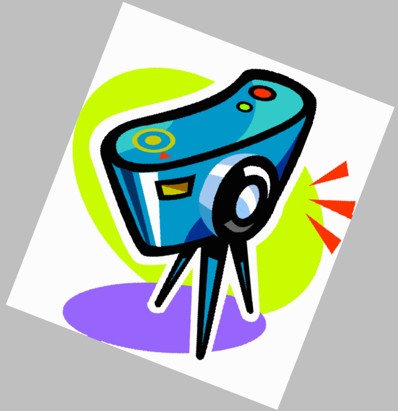
Photo Retakes will take place Monday, September 17.